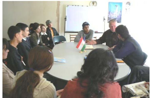
On Wednesdays I serve as Current Affairs discussion leader at the American Corner in the Khudjand City Library.