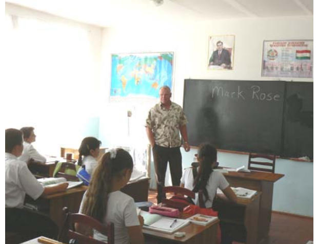
I am now teaching 7th graders American History at the Gymnasium of Languages on Thursdays.

These opportunities would not be possible without your prayers and support. Please continue to pray for the work in Tajikistan.