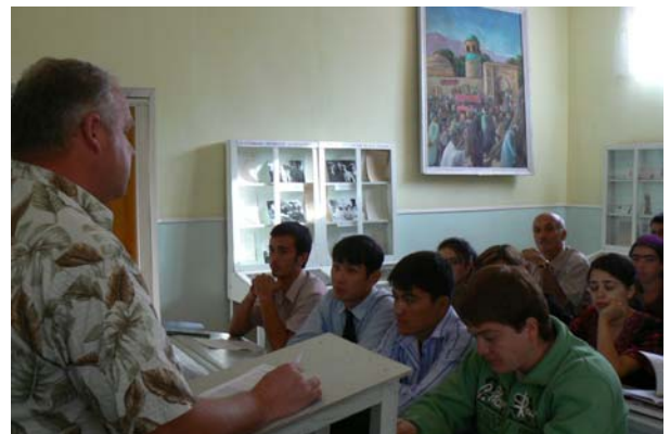
Lecturing at the Khudjand State University to seniors and professors.